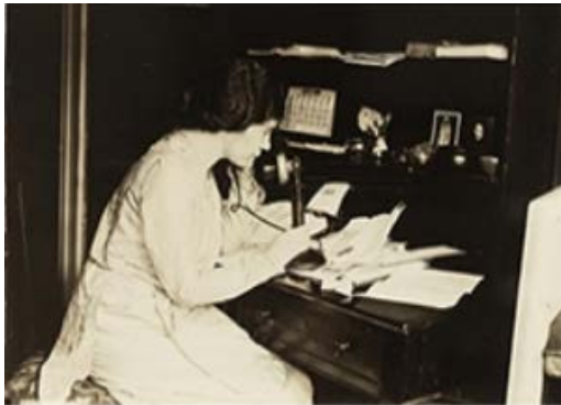
Alice Paul, 1913