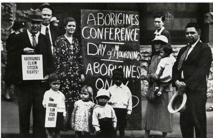
Aboriginal Day of Mourning, 26 January 1938 Man magazine, March 1938

The debate about the name and date of Australia Day has been contested for a very long time, and remains as topical as ever. Many members of the Aboriginal and Torres Strait Islander community call it Survival Day, while for many others it's Invasion Day. Take a closer look at how this date and name has always generated fierce debate.