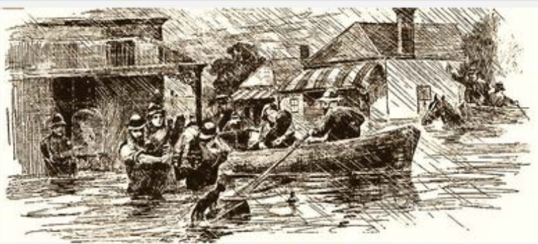
'The Inundations at Marrickville: Rescuing the Homeless' May 1889